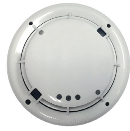
MULTI-CRITERIA SENSOR CO, COHb, SMOKE, HEAT

The Smoke & Heat Multi-Criteria Sensor is particularly suited for detecting smoke produced by a wide range of combustibles found in various applications. Temperature monitoring is achieved by a thermistor placed for optimum sensitivity.