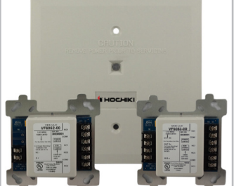
DUAL RELAY MODULES

Supervised Output Modules have been designed to provide application flexibility and quick response to emergency conditions. Flexibility is provided by a wide range of operating modes, including supporting multi-zone operations, and/or functions, up to 16 different modulation patterns and multi-state programming.