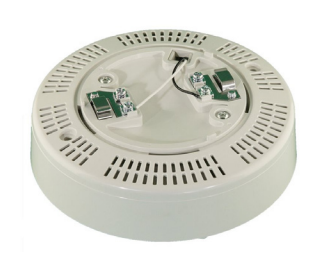
6" ANALOG LOW FREQUENCY SOUNDER BASE

The Dual Relay Modules have been designed to provide flexible and quick response to emergency conditions. They allow independent control of two form C contacts for a variety of normally open and normally closed contact applications such as fan operation, elevator recall, door closure, and auxiliary notification.