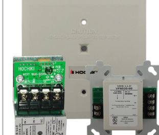
FAST RESPONSE CONTACT MODULES FAST RESPONSE CONTACT MODULES

The CO, COHb, Smoke, & Heat Multi-Criteria Sensor is particularly suited for detecting smoke produced by a wide range of combustibles found in various applications. Temperature monitoring is achieved by a thermistor placed for optimum sensitivity. The sensor is also suited for detecting deadly levels of CO.