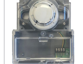
ANALOG DUCT DETECTOR

The Conventional Zone Module provides the ability to upgrade locations on a phased approach or monitor a zone of conventional detectors. This capability is key to satisfying customer needs for a system upgrade over time, and allows a best case application of technology to match the upgrade with the customer's budget.