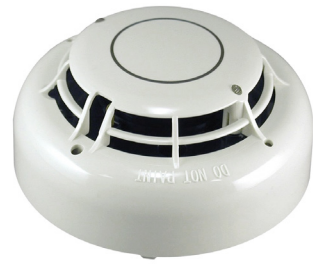
FIXED TEMPERATURE / RATE OF RISE HEAT SENSOR