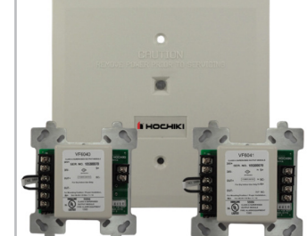
SUPERVISED OUTPUT MODULES

The Short Circuit Isolator provides the capability of allowing NFPA SLC Style 7 installations and checks the line for short circuit at power up; if the line is normal, the relay will be returned on. If a line short is detected, the relay remains open.