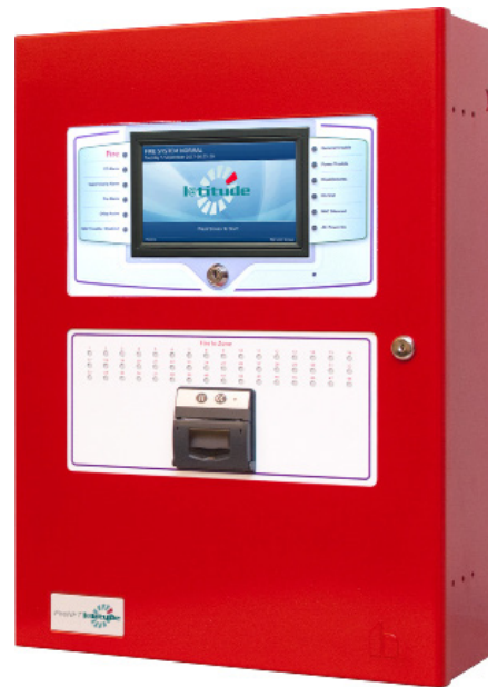
Double Aperture Includes Zone LED Module and Printer