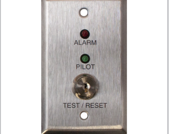
ANALOG DUCT SENSOR REMOTE ACCESSORIES

DH-100-A Analog duct smoke detector provides early detection of smoke and products of combustion present in air moving through HVAC ducts in Commercial, Industrial and Residential applications. The DH-100-A is designed to prevent the recirculation of smoke in areas by the air handling systems, fans and blowers.