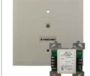
DUAL INPUT MONITOR MODULE

Addressable manual pull stations provide a fast and practical means of manually initiating a fire alarm signal. Both single action and dual action manual pull stations are available.