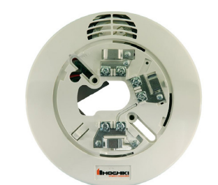
6" ANALOG SOUNDER BASE

This base is designed for use with analog sensors. Designed to be connected to a DCP Signaling Line Circuit (SLC), it provides a Low Frequency audible alarm in the immediate vicinity and has a configurable programming algorithm that allows the user to set up groups of bases for synchronization of modulation tones.