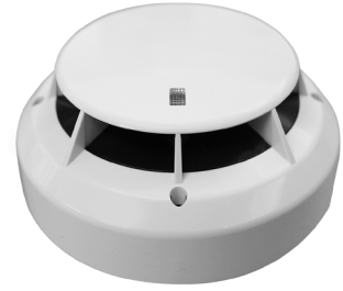
ANALOG PHOTOELECTRIC SMOKE DETECTOR

The Fixed Temperature / Rate of Rise sensors provide accurate temperature measurement data to the fire alarm control panel. These sensors are well-suited for environments where dust, cooking fumes, or other factors make the use of smoke sensors impractical.