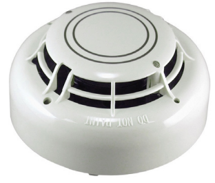
MULTI-CRITERIA SENSOR SMOKE & HEAT

The ALO-V (UL 268 7th edition listed) is a reliable, high quality multi-criteria Photoelectric Smoke Detector. It can be used in all open areas where Photoelectric Smoke Detectors are required. This detector is also suitable for monitoring smoke in HVAC ducts. The newly developed "multi-spectrum smoke categorization technology" detects smoldering and flaming fires fueled by traditional materials and polyurethane while reducing nuisance alarms.