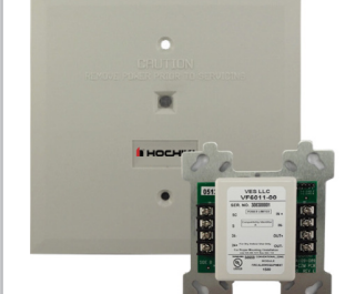
CONVENTIONAL ZONE MODULE

The Dual Input Monitor Module provides an economical approach to monitor devices in the same proximity, such as water flow and valve supervision on the same interface device.