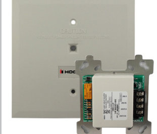
SHORT CIRCUIT ISOLATOR

The Contact Modules are designed to be used with pull stations, water flow switches, and other applications requiring the monitoring of dry contact alarm initiating devices.